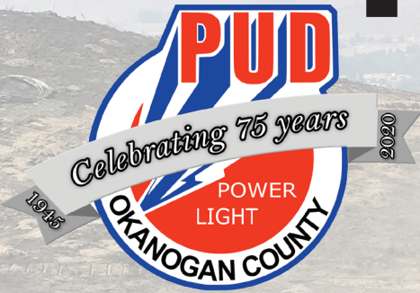
Photo behind: Crews work on Jackass Butte above Okanogan after the Cold Springs Fire.