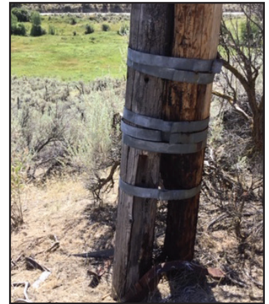
Top photo: Power transformers like this one recently installed at Ellisforde are among top priorities for the capital project. Bottom left: Infrastructure also affects broadband opportunities, as the infrastructure has to support new equipment. Bottom right: Ever seen a stubbed pole like this in your area? Stubbing is used to increase the lifespan of poles that need to be replaced soon.